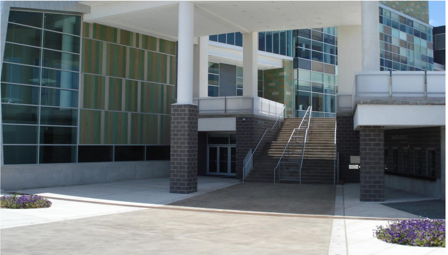
The Grand Staircase to main entrance of City Terrace on the right Rollins Lobby Doors are to the left of the stairs- for elevator access to Terrace